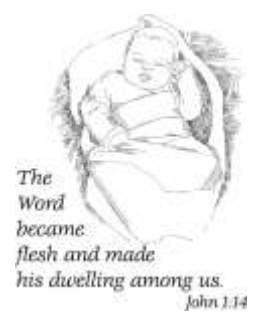
Christmas Eve – 11