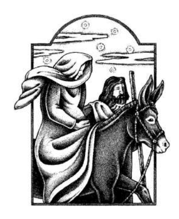
Christmas Eve – 5