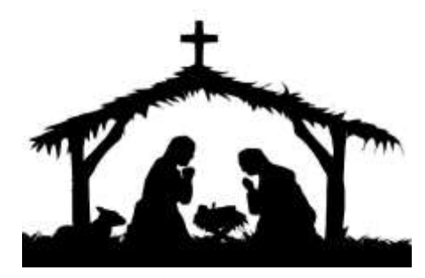
Christmas Eve – 2