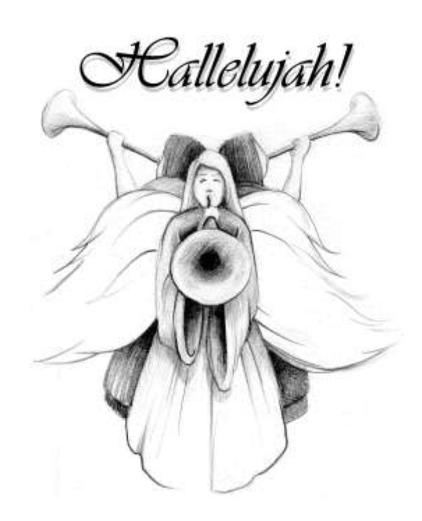
Christmas Eve – 8

<sup>15</sup> When the angels had left them and gone into heaven, the shepherds said to one another, "Let's go to Bethlehem and see this thing that has happened, which the Lord has told us about."